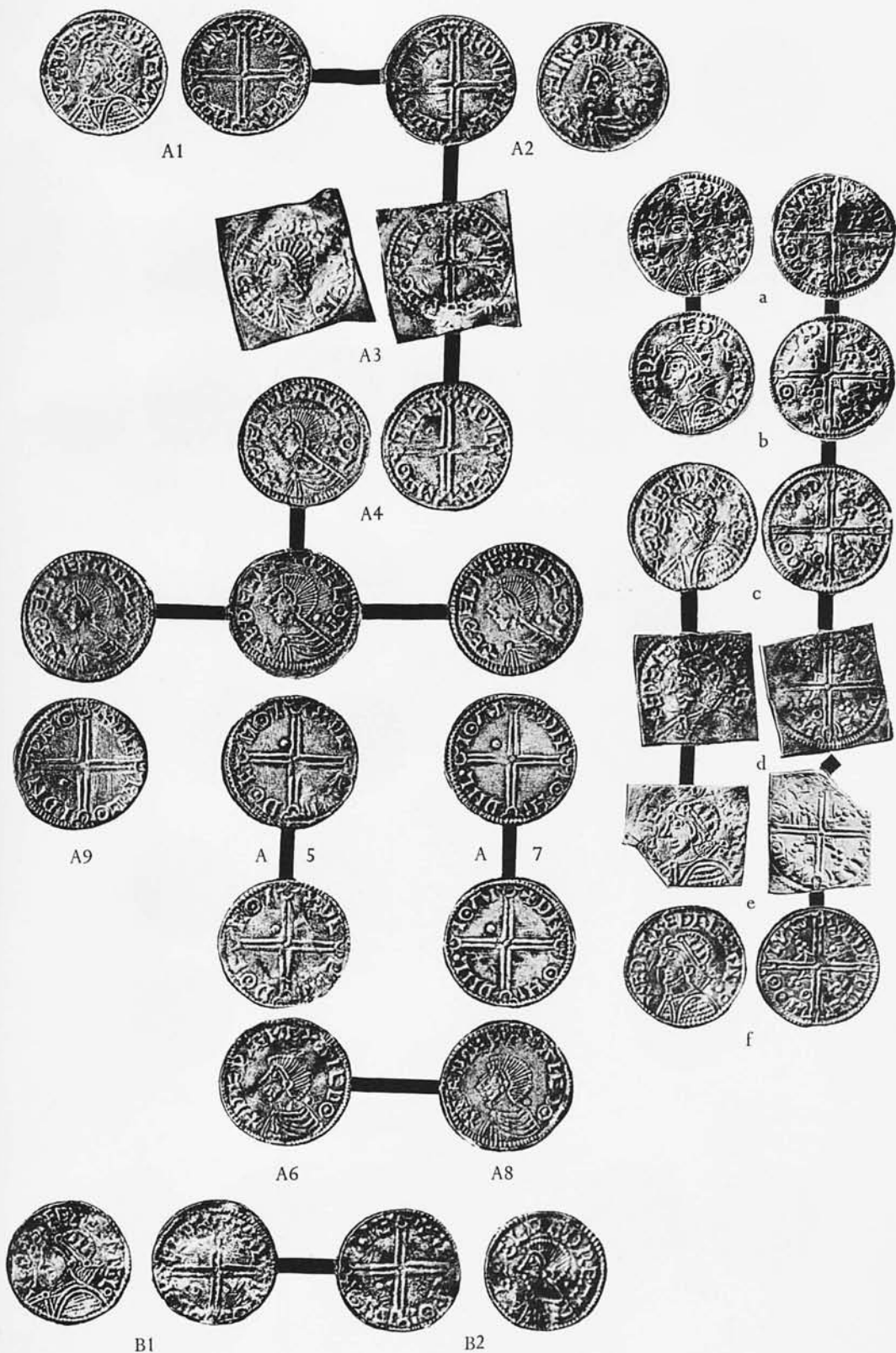
MYTHICAL HELMET/LONG CROSS MULES OF AETHELRAED II