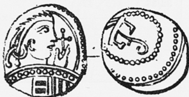
FIG. 4— Fitzw. 255, as illustrated in Camden's Britannia . The irregularities of the flan, etc., are faithfully reproduced, but the reverse design has apparently been laterally reversed by the engraver.

from A-B. On the reverse, the wolf-whorl is laterally reversed; the style of the wolf's head is difficult to judge, but it is not closely in accord with C-D, as the upper jaw is short, the gape is wide, and the lower jaw is parallel with the upper. The weight of these two coins—16.3 and 16.4 gr.—would be appropriate to either group. One of the coins was found at Reculver (see Fig. 4). Are they the hinge which joins the two groups? There seems insufficient reason for such a claim: no stylistic progression can be argued from them to group A-B (it could hardly be in the other direction, for reasons of metrology), and the similarities will perhaps be better interpreted as the result of copying.