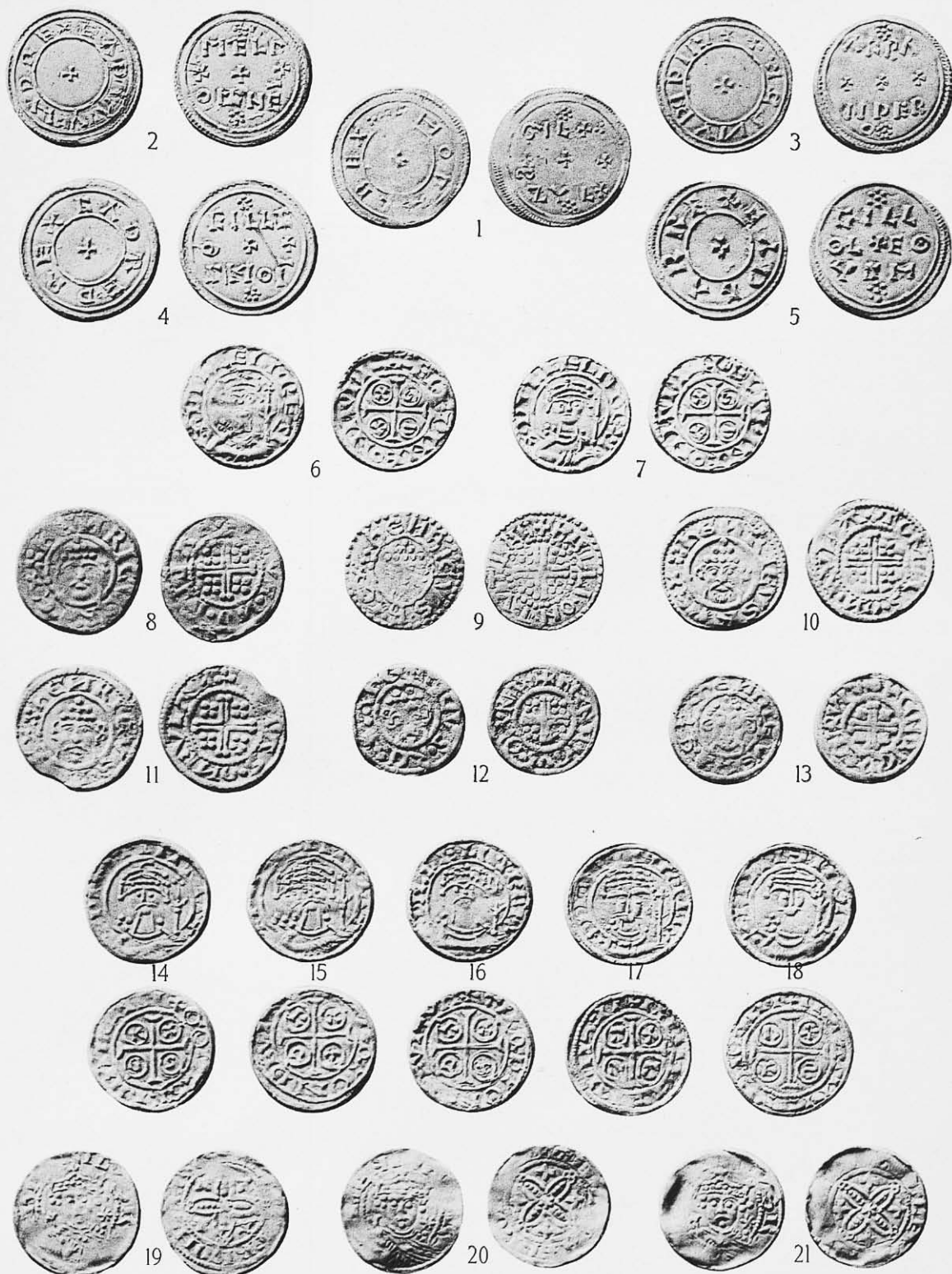
THE SAXON, NORMAN AND PLANTAGENET COINAGE OF WALES (WITH FOUR ANGLO-SAXON PENNIES.)